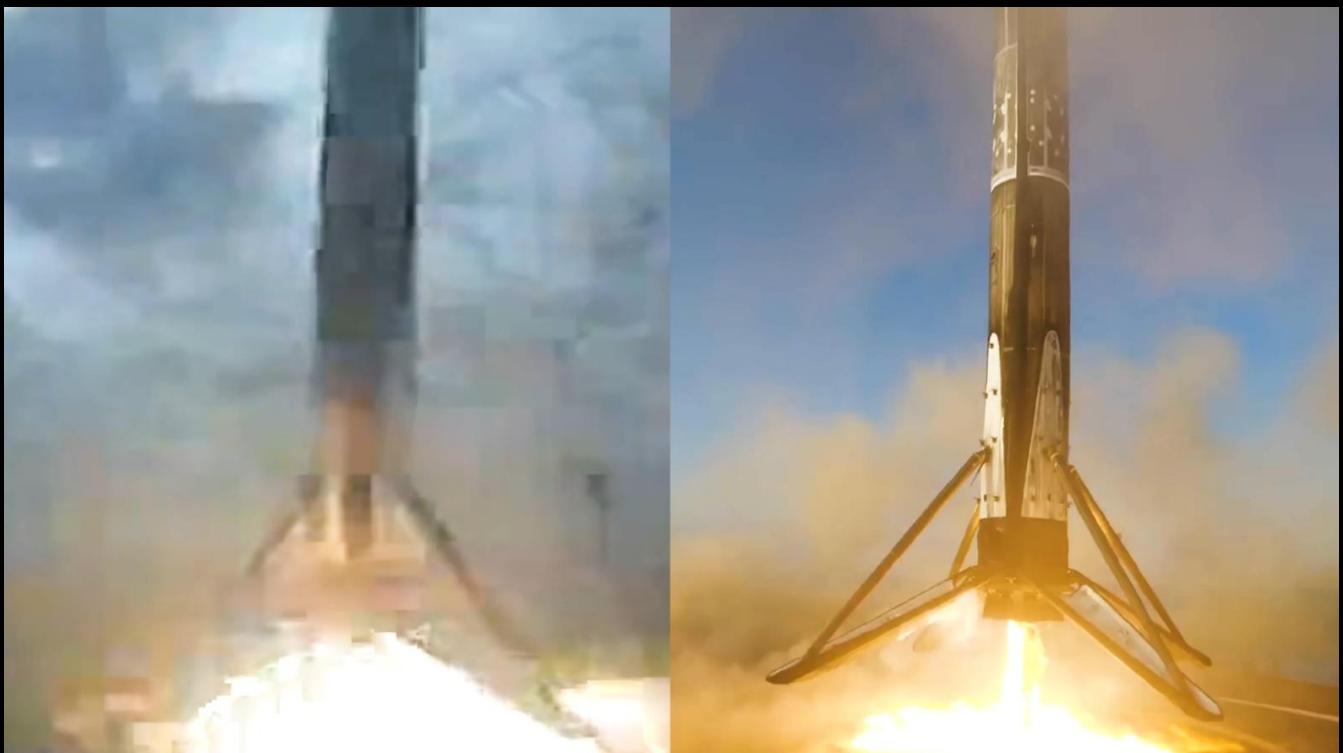
LEFT: frame of a Falcon 9 rocket landing at sea using VSAT systems. RIGHT: frame of a Falcon 9 rocket landing at sea using Starlink.

In addition to latency challenges, with VSAT, the lack of bandwidth coupled with the intense vibrations from the rocket engines often led to total dropouts in video and data.